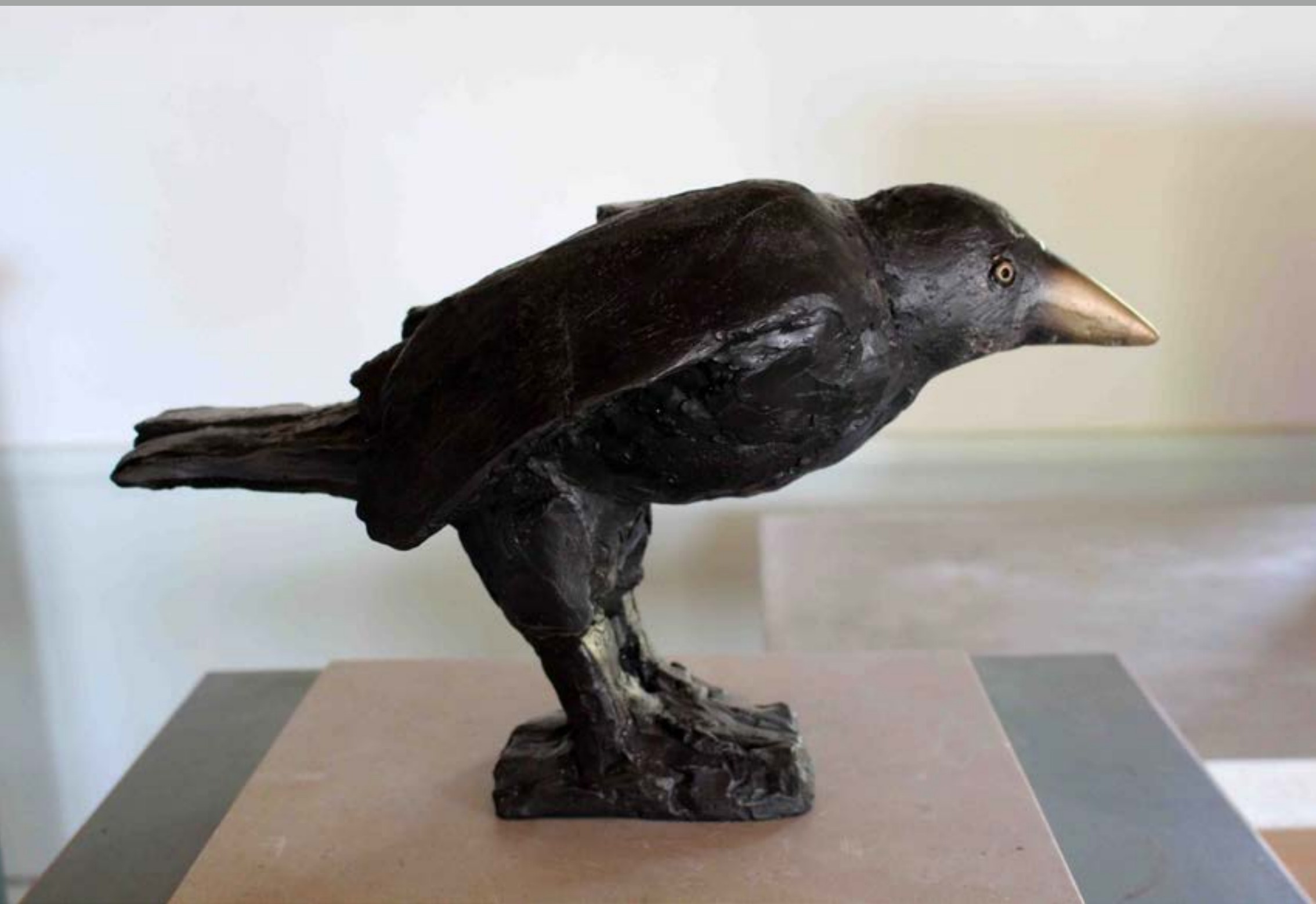
2018 CORVUS, Bronze, H 25, L 42, B 18 cm, 10 kg