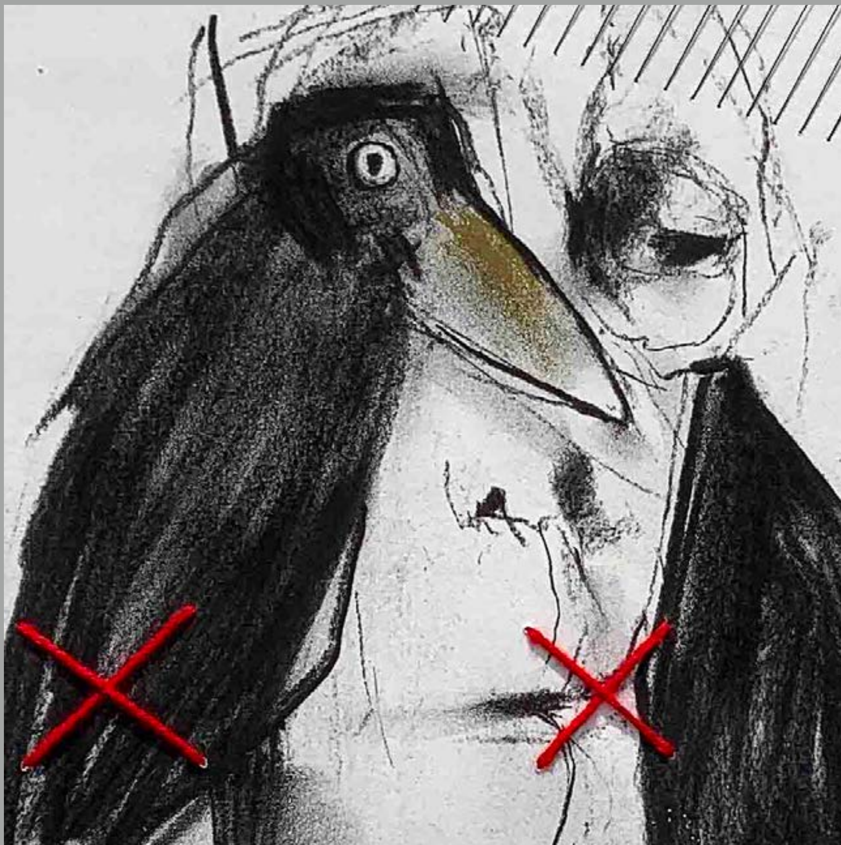
2020, BIRD ME, Pastels charcoal needlework on Gicleé, 80x59 cm