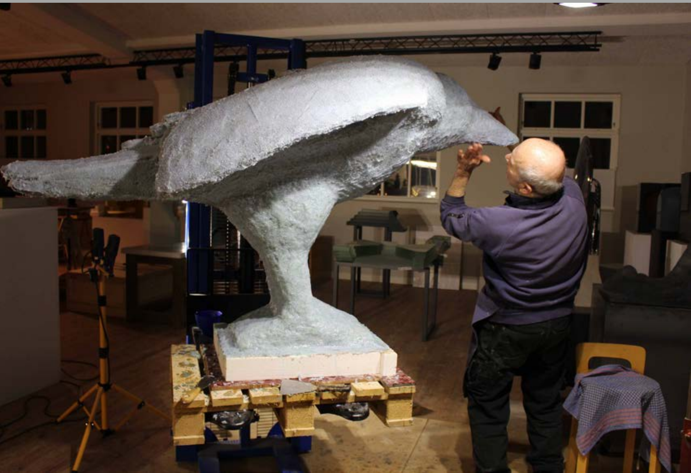
Preparing mold for casting