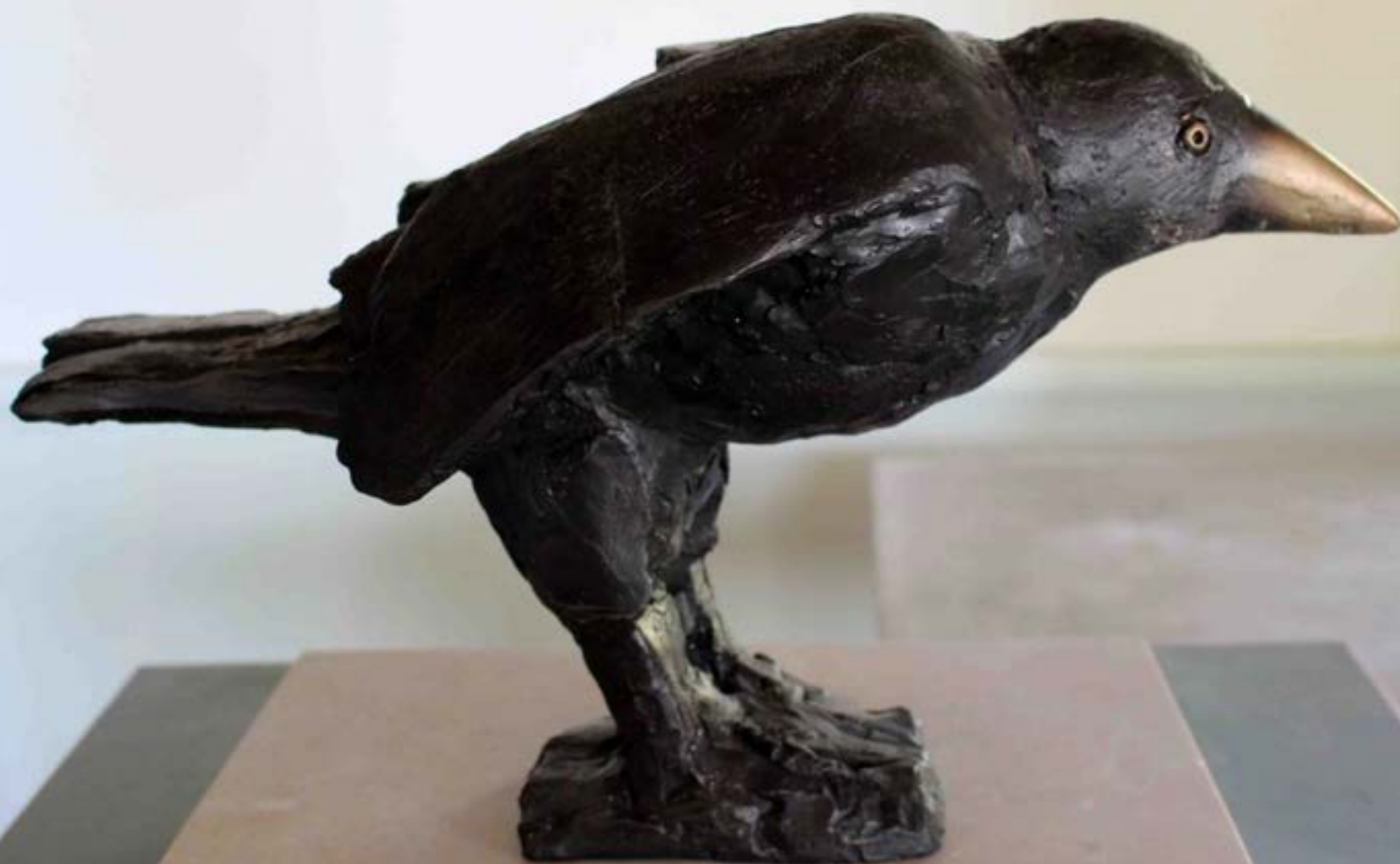
2018 CORVUS, Bronze, H 25, L 42, B 18 cm, 10 kg